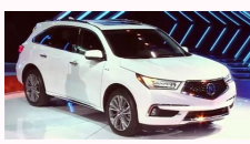
2020 rdx manual. Acura rdx manual 2020.